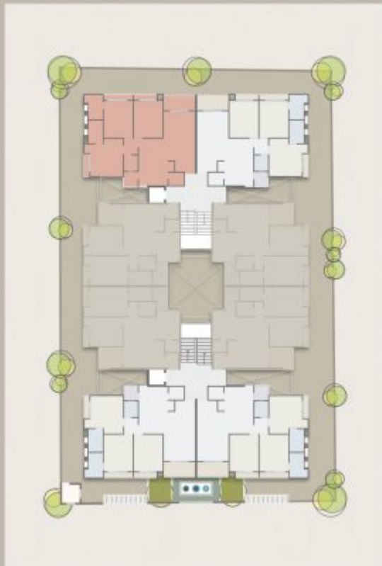
TYPICAL FLOOR PLAN (1ST TO 5TH)