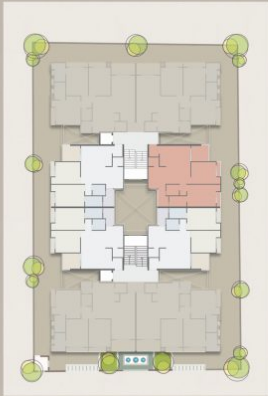
TYPICAL FLOOR PLAN (1ST TO 5TH)